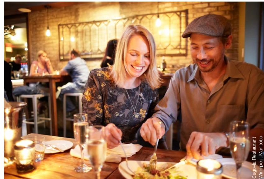
Segovia Restaurant Winnipeg, Manitoba